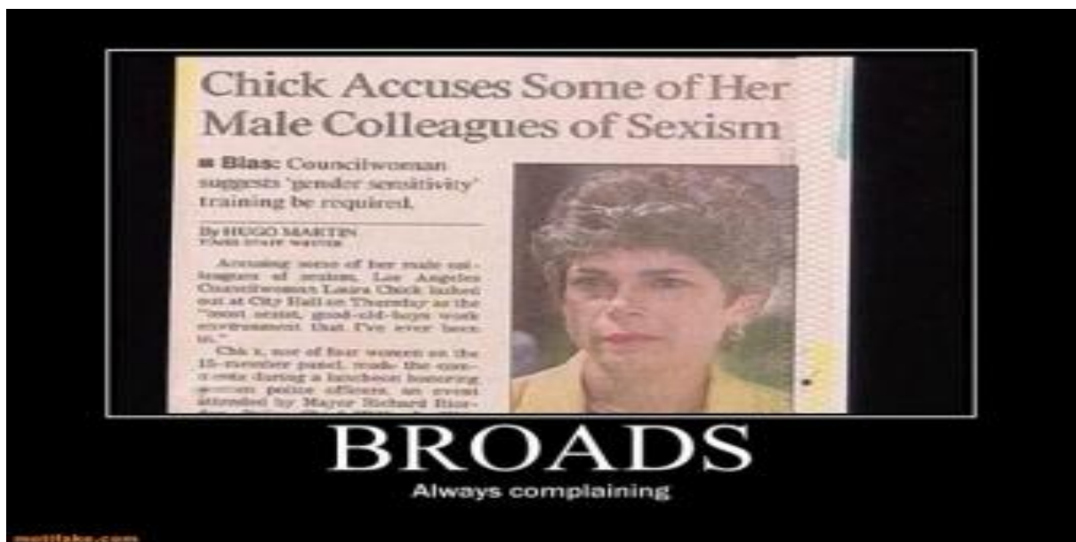
Picture 1 (Taken from: http://articles.latimes.com/1995-06-24/news/mn-23690_1_gender-sensitivity ; the article published by The L.A. Times on June 24, 1995)